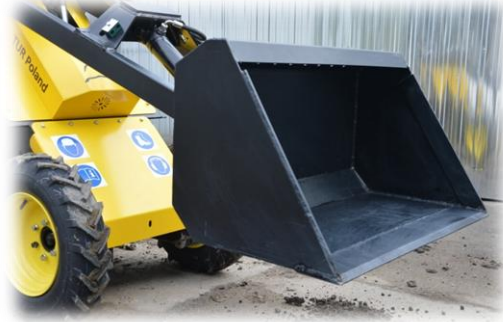
Standard Size Bucket