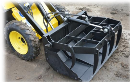
Gripper with Teeth